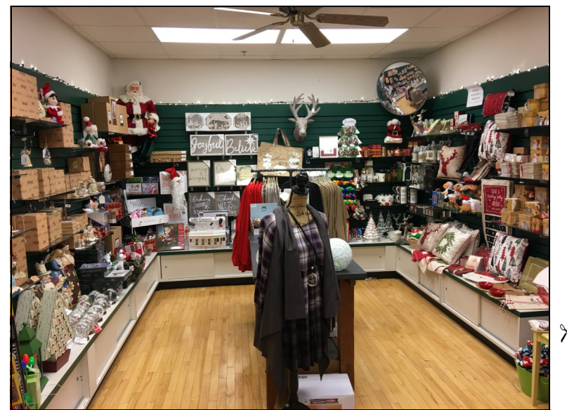
It's beginning to look a lot like Christmas! Stop by and shop our Christmas room!